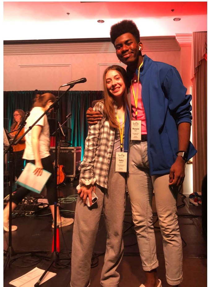
More Road Trip Photos