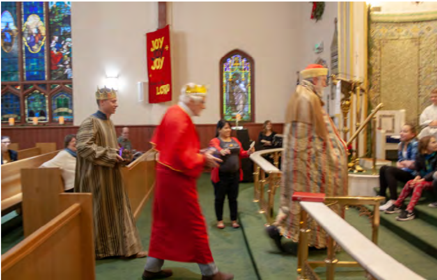
Entrance of the Three Kings during the Children's Message.