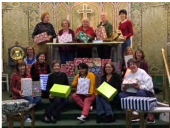
Stitchcrafters with Seafarer Boxes, October 2018