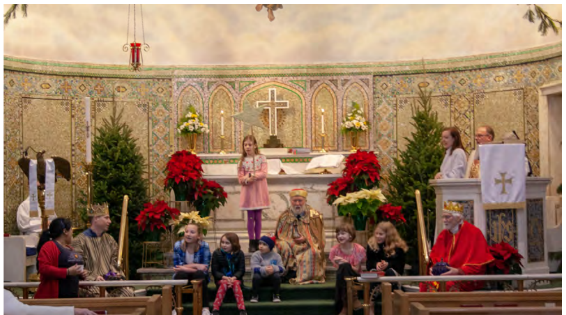
The Kings and the children listen to the message.