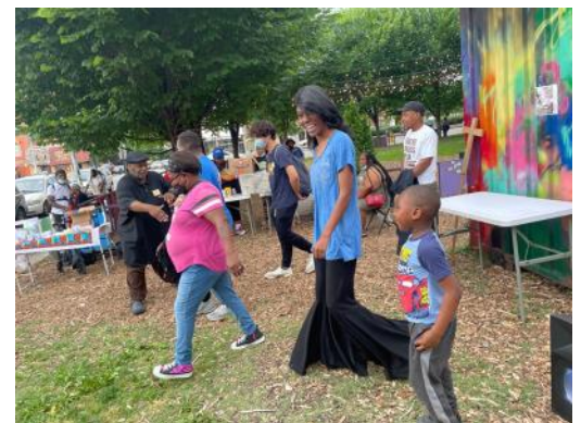
Doing a T.O. game at Family Life