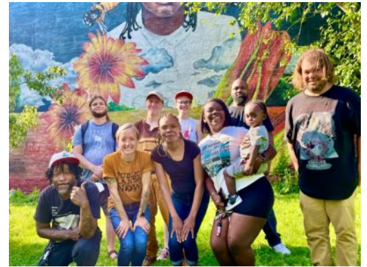
ELCA Horizon Apprenticeship Interns