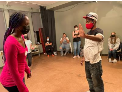
At Restorative Theatre Project, NYC