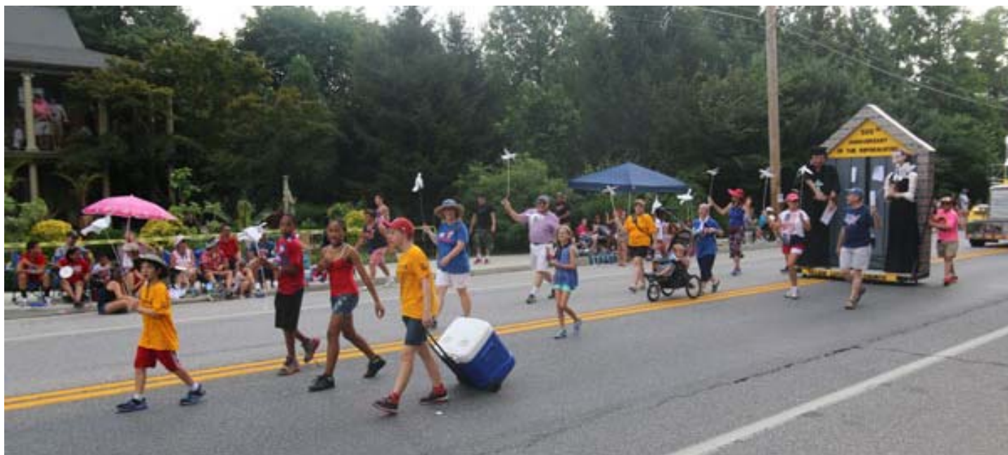
Salem's 2017 July 4 th Parade entry

Would you like to march in Catonsville's Fourth of July Parade? Salem will be participating in the parade as a part of our 175 th anniversary celebrations. We'll be making parade signs after the late service on June 30. To sign up as a marcher, a sign-maker, or for more information, please visit the sign-up sheet in the church narthex or contact the church office.