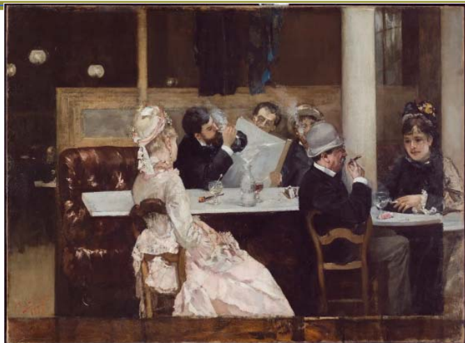
Café Scene in Paris, 1877, Henri Gervex, Detroit Institute of Arts

Next I completely geeked out at seeing my first Monet, Manet, Cezanne, Van Gogh, Rodin, Renoir, Courbert, Degas, and Gervex....in less than a half hour. Spinning through the Impressionist halls like one of Degas ballerinas. I went back and just stared at them until they were imprinted on my retinas. Cafe Serene in Paris, by Henri Gervex particularly caught my attention. The thin beam of light on the woman to the right made everything seem so real. A day in the life of your average well-to-do Parisian. I'm pretty sure the walls of heaven are adorned with art like this.