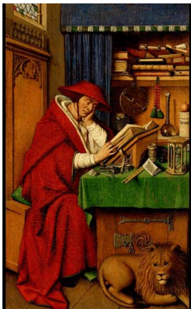
Saint Jerome in his study, ca. 1435 Jan van Eyck, Detroit Institute of Arts

...a few paintings down is Mary and Martha, the epitome of haggard and hostess. Mary, answering young Hope from the adjacent painting with "I know exactly where I belong and no one is going to tell me otherwise". Onward were paintings of nobles, saints, and the entombment of Christ. The painting of the Ecstasy of Saint Francis was a bit too graphic for my freshly filled stomach, so I moved into the statue room filled with Renaissance iconography.