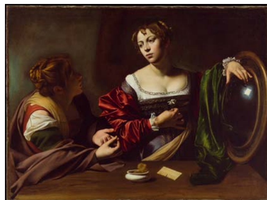
Martha and Mary Magdalene ca. 1598 Michelangelo Merisi da Caravaggio, Detroit Institute of Art